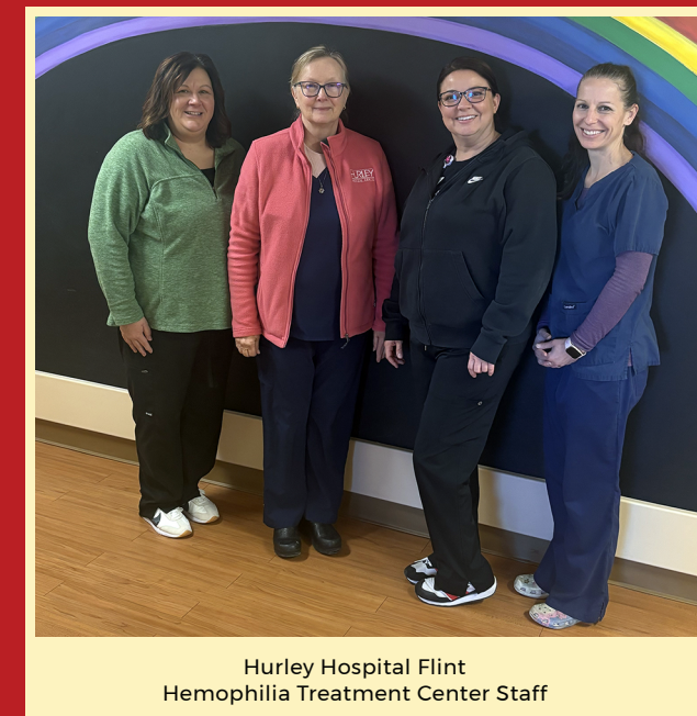
Hurley Hospital Flint Hemophilia Treatment Center Staff