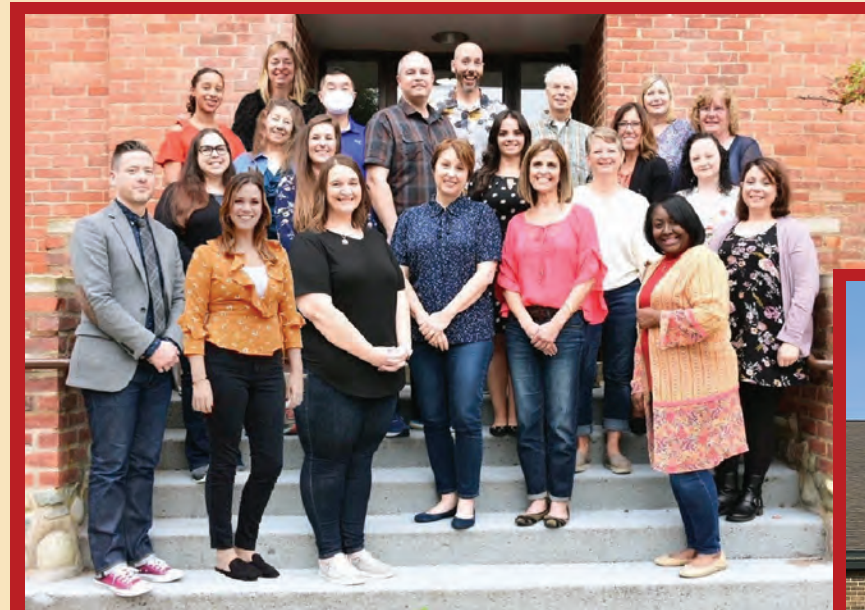
The Cascade Team

Thank you again for your support. We've enjoyed working with each and every one of you! The Staff at Cascade