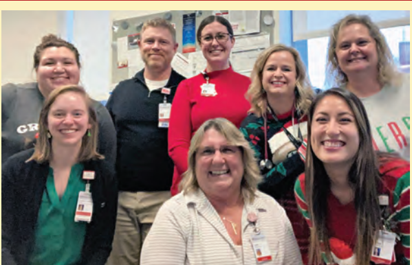
Ohio State University Hemophilia Treatment Center, Columbus