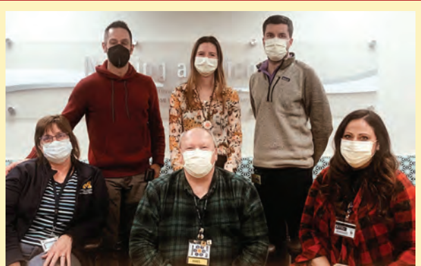
Michigan Medicine Hemophilia Treatment Center, Ann Arbor