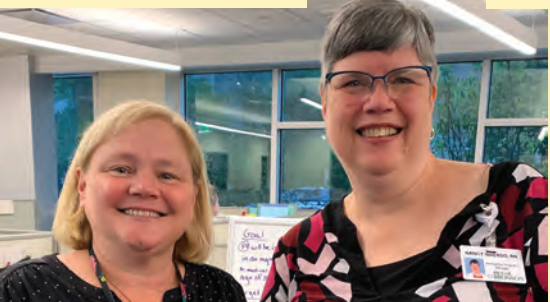
Bronson Methodist Hospital Hemophilia Treatment Center, Kalamazoo

(Many events in 2021 were conducted virtually or delayed due to COVID.)