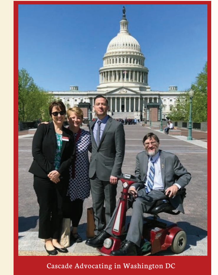
Cascade Advocating in Washington DC