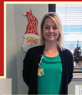
Promedica Children's Hospital HTC Toledo