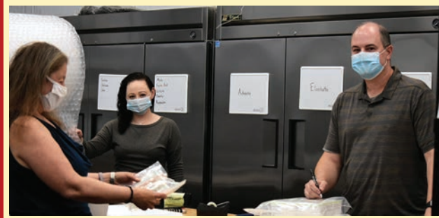
Cascade Pharmacy Staff

Our second goal is to support patient care and education in our region. We do this by utilizing all revenue after expenses to provide financial support and services to our region's HTC's and Chapter Foundations. We support and partner with the HTC's and Foundations to provide direct patient care, educational conferences/events and emergency financial assistance for patients like you. By choosing Cascade as your provider, you have helped to provide over $56 million in total to the bleeding disorder community since 1997.