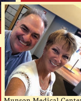
Munson Medical Center HTC, Traverse City