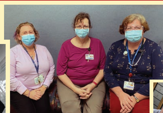
Henry Ford Hospital HTC, Detroit