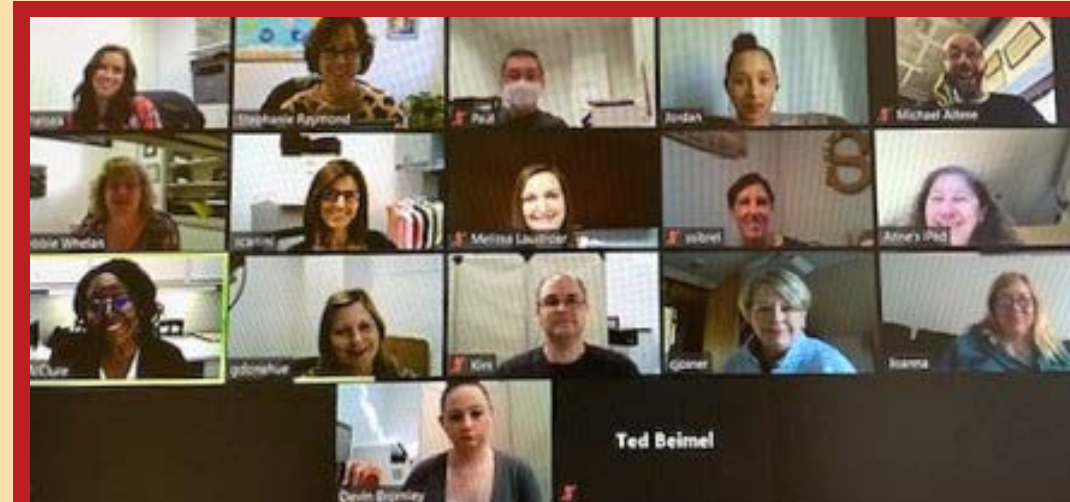
The Cascade Team

Thank you again for your support. We've enjoyed working with each and every one of you! The Staff at Cascade