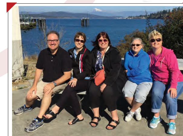
Hemophilia Treatment Center staff enjoying a pre-conference side-trip